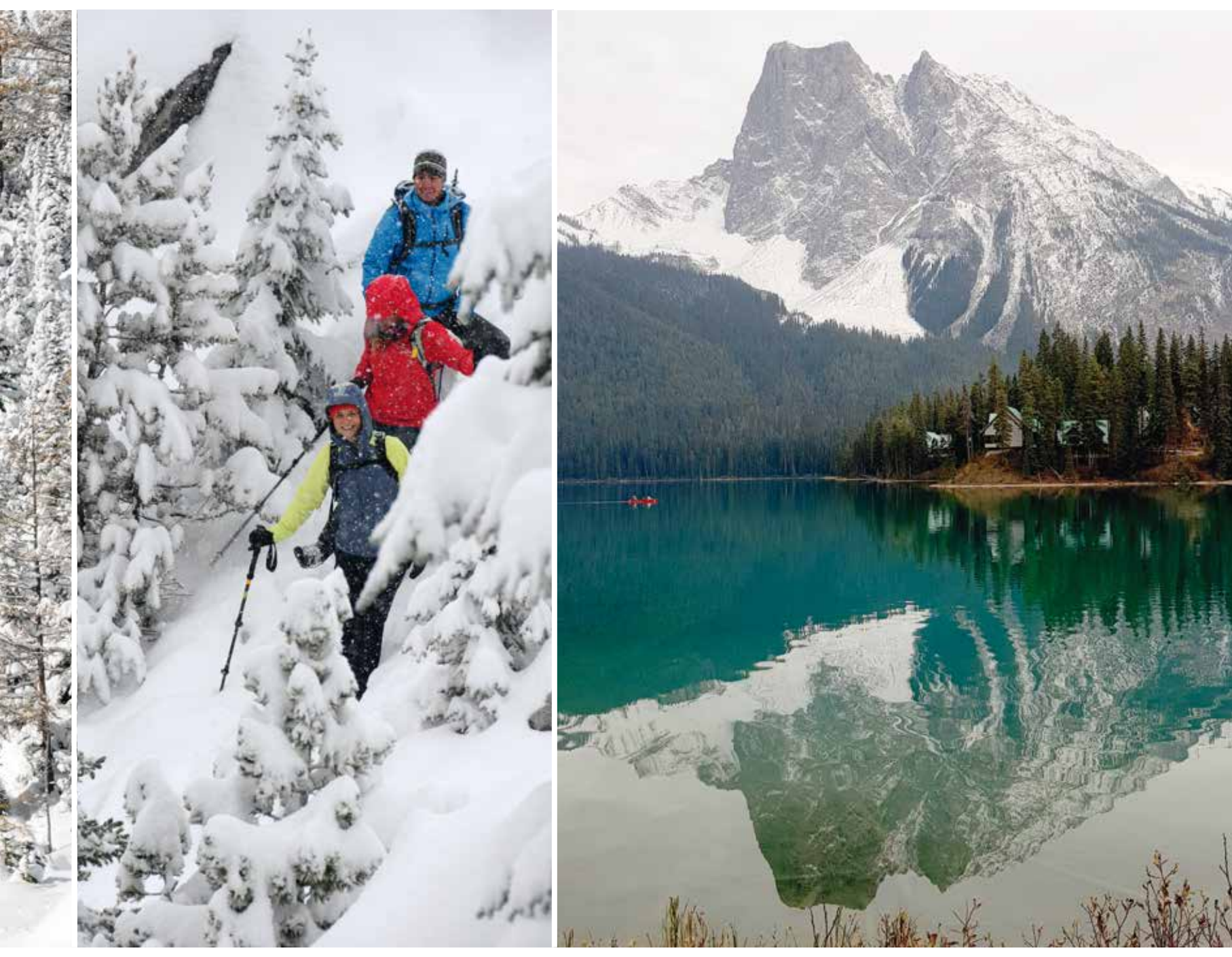
FROM LEFT HIKING AROUND AGNES LAKE NEAR LAKE LOUISE; FRESH AUTUMN SNOW ON SULPHUR MOUNTAIN RIDGE, BANFF; MOUNT BURGESS REFLECTION IN EMERALD LAKE, YOHO NATIONAL PARK.

climate change add further to such variability. This year the snow came early; the autumn colours whited out.