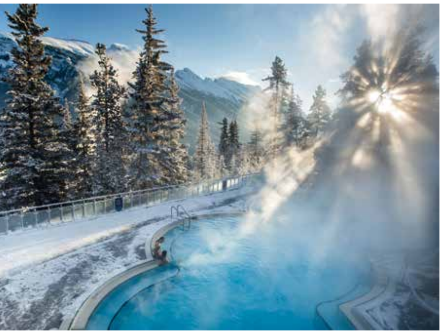
FROM TOP LOOKING DOWN ONTO BANFF FROM SULPHUR MOUNTAIN GONDOLA; BANFF HOT SPRINGS, BANFF.

with a view, is a pleasant 39 degrees and was the original reason for kick-starting tourism in Banff.