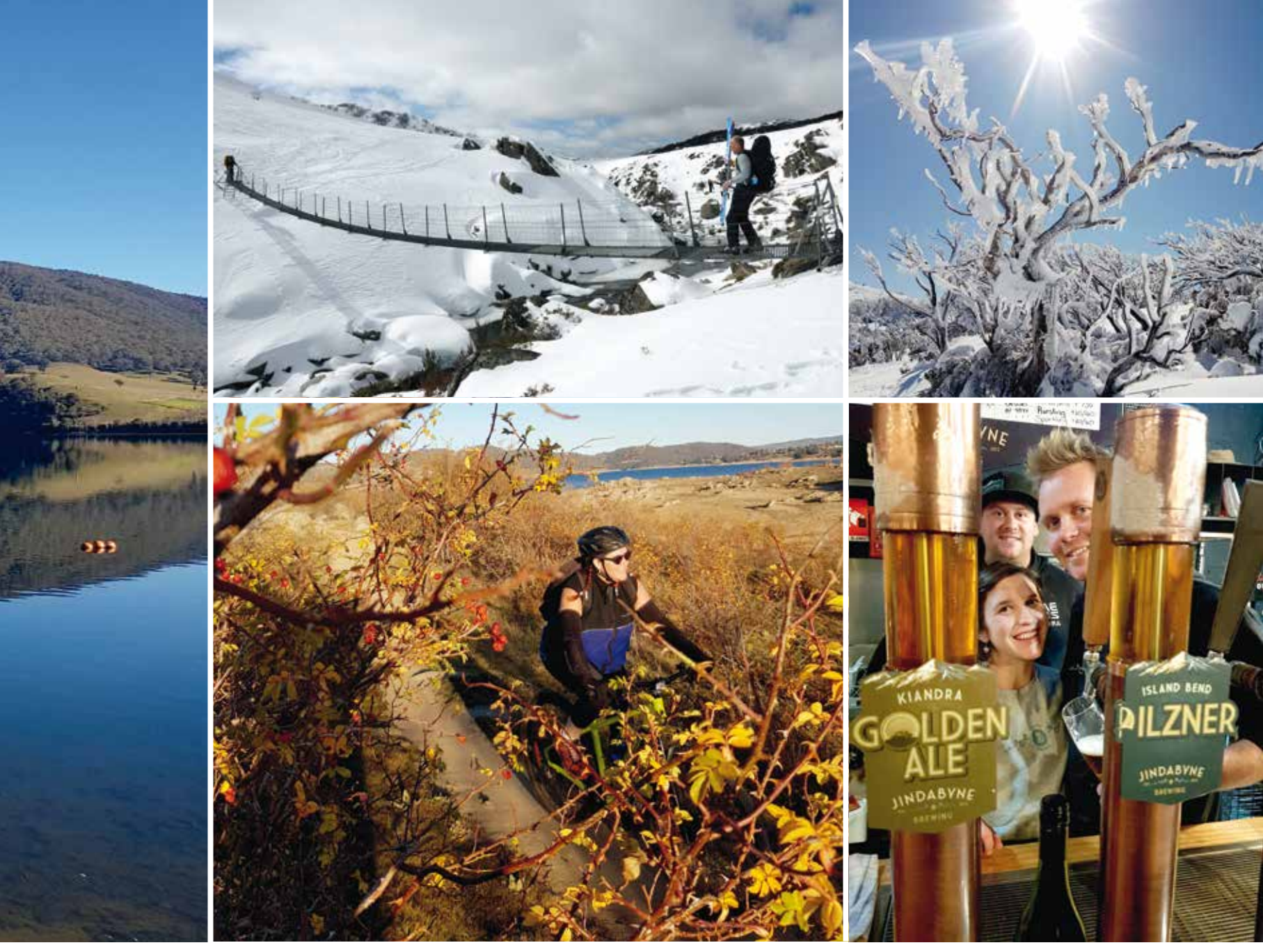
CLOCKWISE FROM MAIN PHOTOGRAPH MILLPOND CONDITIONS ON KHANCOBAN PONDAGE, PART OF THE SNOWY MOUNTAINS HYDRO SCHEME; SWING BRIDGE ACROSS THE SNOWY RIVER IN WINTER; RIME ICE ON A FIRE DAMAGED SNOWGUM; THE CREW AT JINDABYNE BREWING; ON THE BIKE TRAIL TO HATCHERY BAY, JINDABYNE.

Services NSW Museum, attached to Cooma Gaol, tells the story of prison life from the First Fleet to today. The lockdowns of 2020 are hopefully the closest any of us will ever come to this reality.